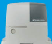
PL-600 Gear Motor